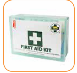
First aid kit