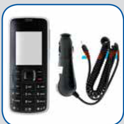
Mobile phone and charger