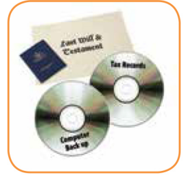
Copy of documents & records